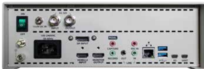
IPS740DS with 3G-SDI